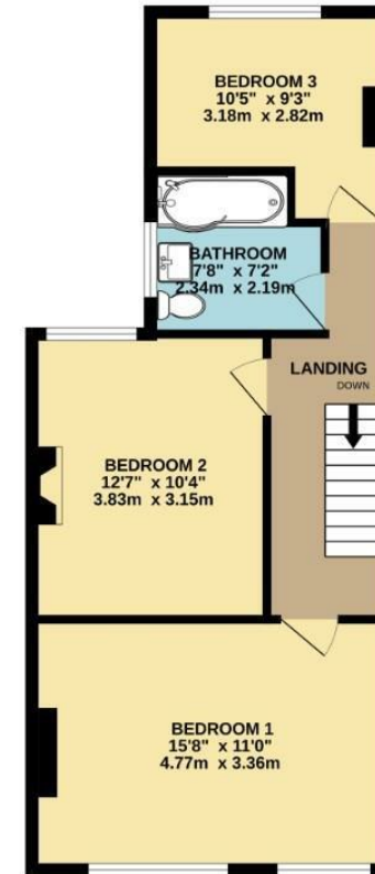
1ST FLOOR 516 sq.ft. (47.9 sq.m.) approx.